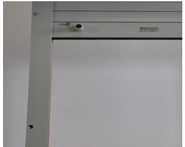
14. Install rail hole plug buttons.