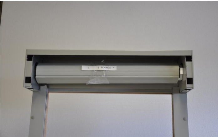
7. Spin axle in direction of shutter going down ( ) turns. Number of turns depends on shutter height. Check information on shutter roll. Turning the wrong way will cause torsion spring to detach.