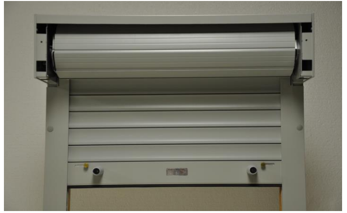
12. Reinstall dead bolts and add stops to keep shutter from going into box cover when raised. Check operation of shutter.