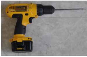
Power driver with 6" Phillips #2 tip is best tool to install the shutter.