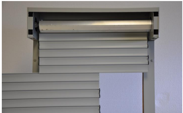
8. Unwrap slat from axle and hang outside of rails. Attach balance of slat bundle and raise shutter.