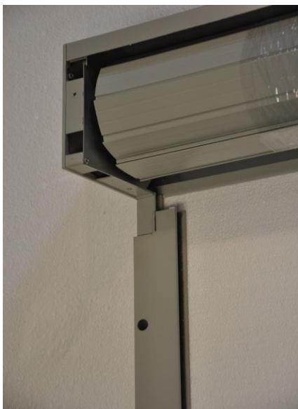
3. Slip rails onto end cap locator legs.