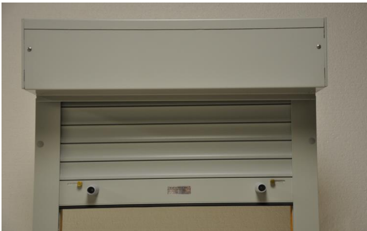
13. Attach face cover.