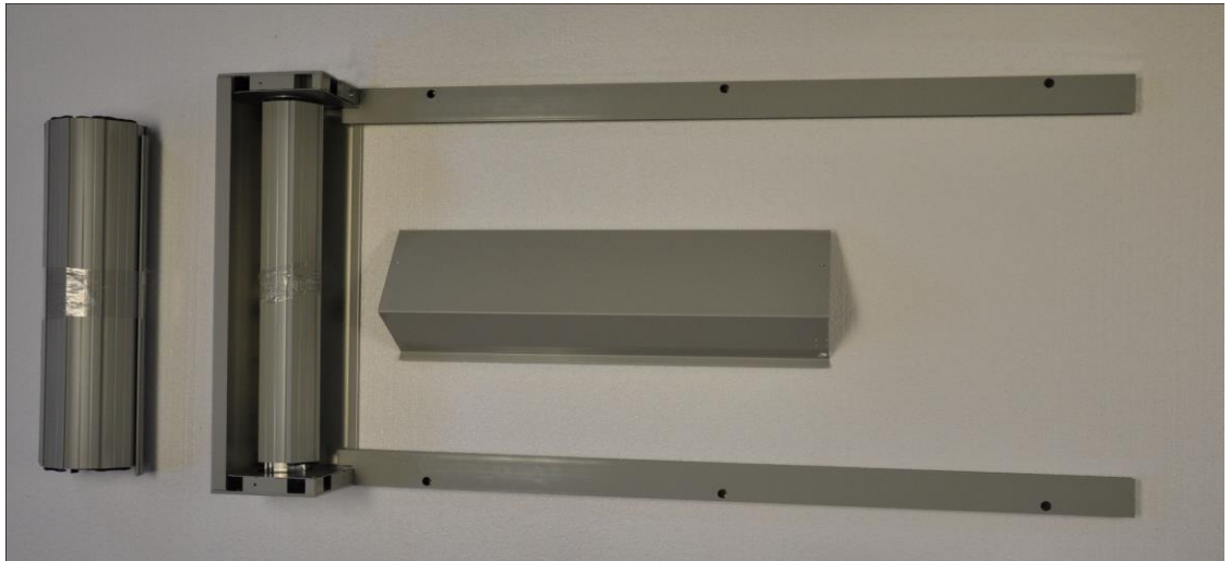
Parts of the shutter with face cover removed. Screws and other small parts are provided.