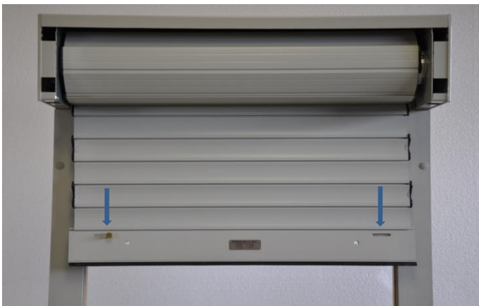
9. Remove dead bolts if installed and raise shutter completely. Lower slat into rails.