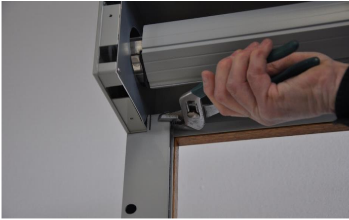
11. Form front rail guide. Use channel lock pliers to bend front ear of rail forward 30 degrees. This forms a guide for the slat to enter the rails.