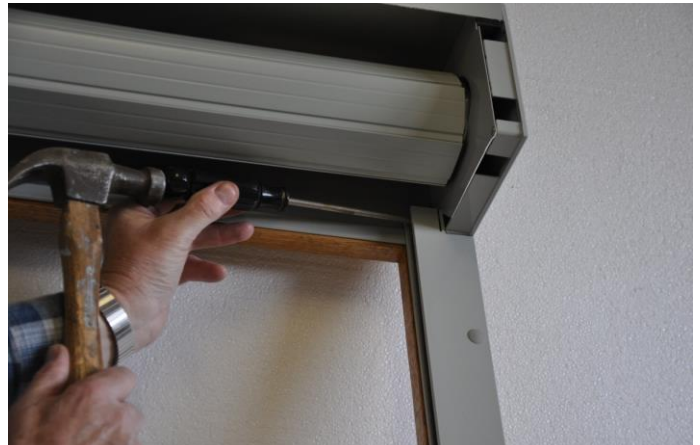
10. Form side of rail by pushing top sideways 1/8"