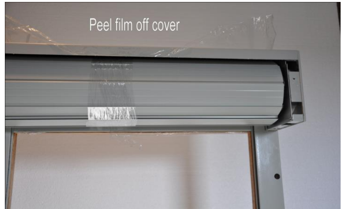
2. Remove protective film from box covers.