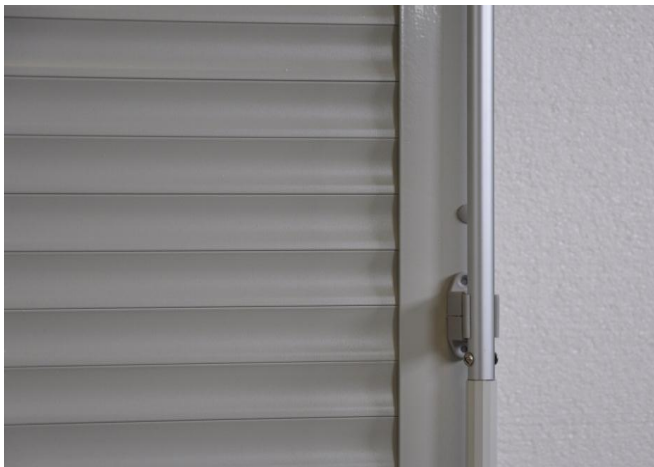
15. Attached crank handle clip to edge of rail.