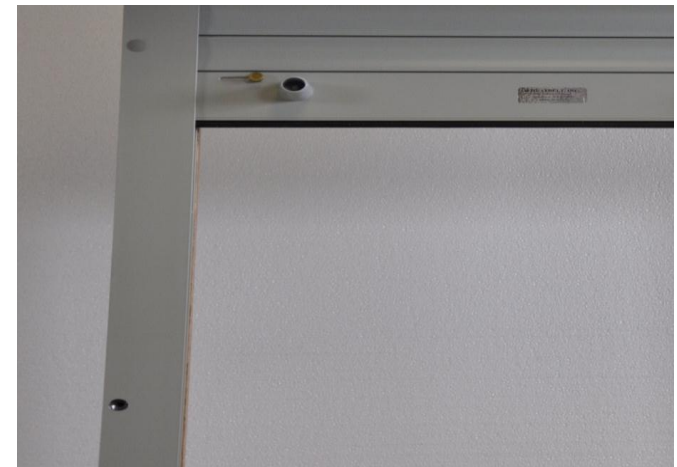
16. Install rail hole plug buttons.