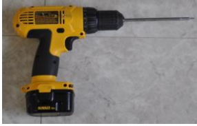
Power driver with 6" Phillips #2 tip is best tool to install the shutter.