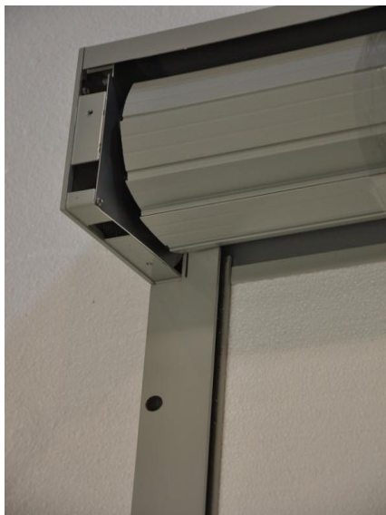
4. Rail totally on locator leg.