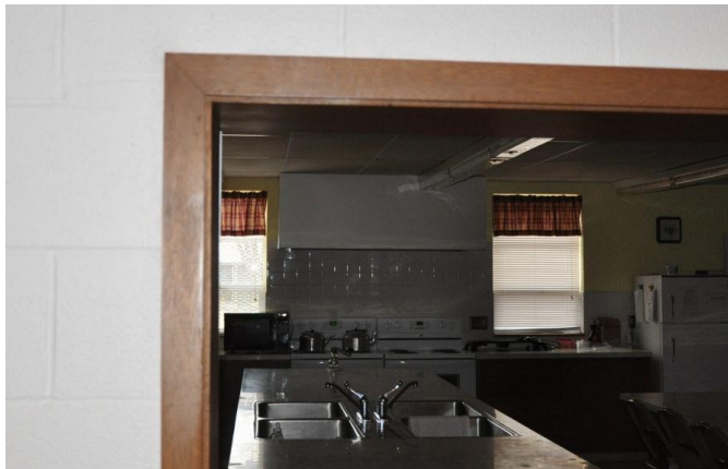
1 Remove casing from jamb if present. Shutter needs to be mounted on a flat surface.