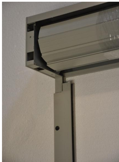
3. Slip rails onto end cap locator legs.