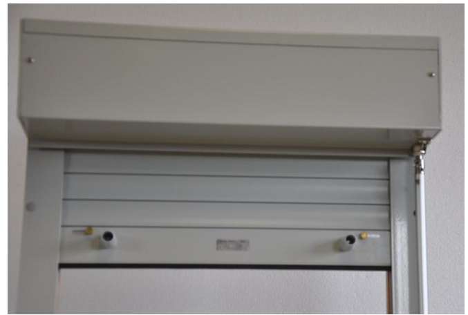
14. Attach face cover and reinstall crank handle.