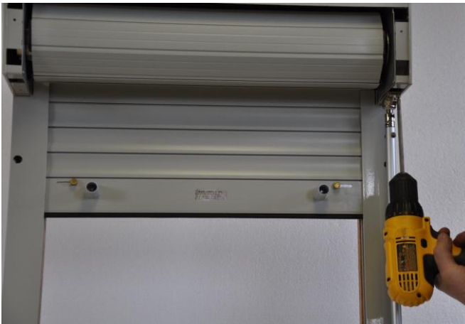
13. Remove crank handle so cover can be installed.