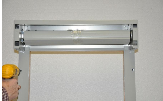
6. Attach the rails to the wall.