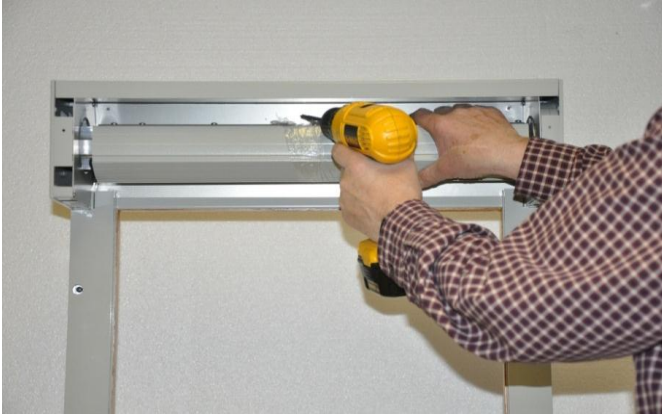
5. Set rails and storage box to the wall location. Always support box until attached to wall or the locator legs can break. They are not load bearing.