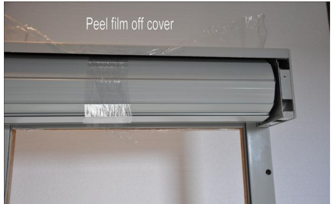
2. Remove protective film from box covers.