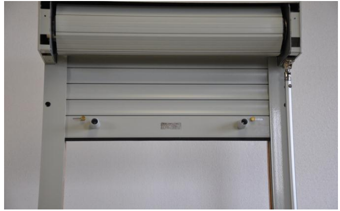
12. Reinstall dead bolts and add stops to keep shutter from going into box cover when raised. Check operation of shutter.