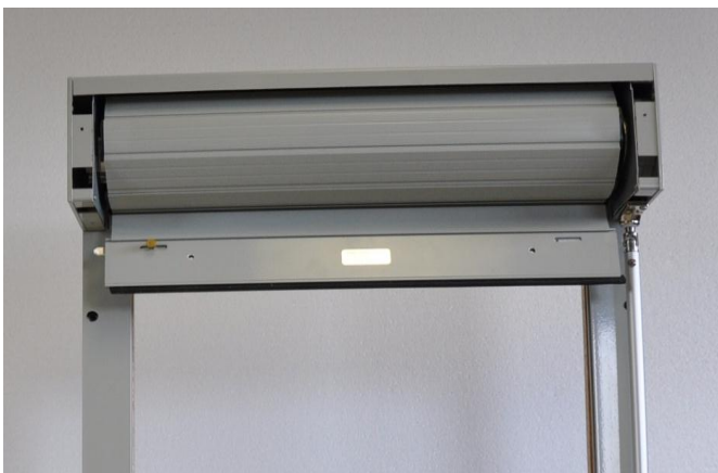
9. Remove dead bolts if installed and raise shutter completely. Drop shutter slat into rails.