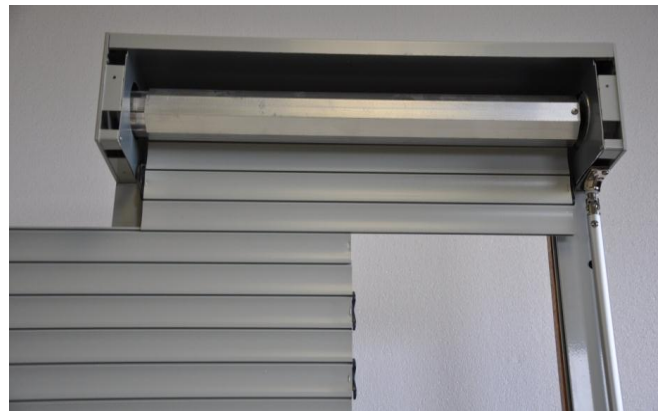
8. Unwrap slat from axle and hang outside of rails. Attach balance of slat bundle and raise shutter with crank.