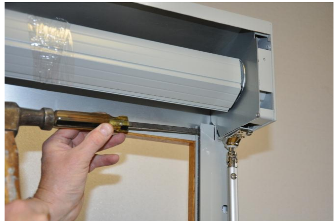
10. Form side side of rail by pushing top sideways 1/8"