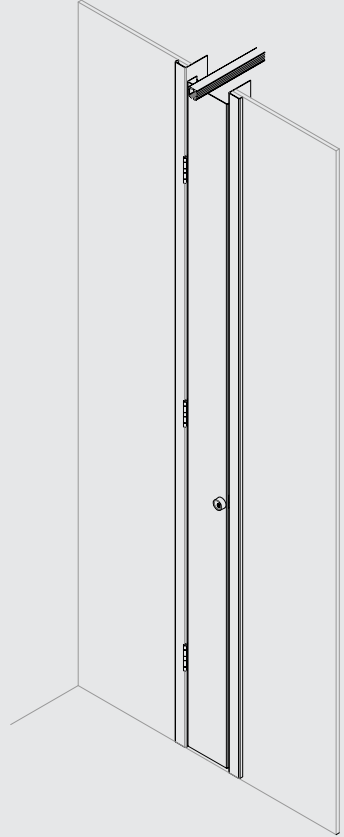
ISOMETRIC VIEW (RIGHT HAND DOOR)